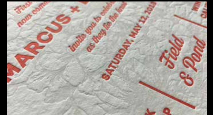
TINTED BLIND STAMP