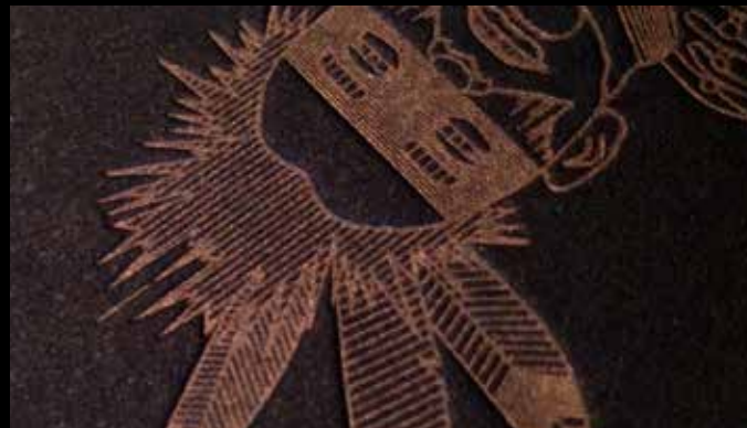
METALLIC (COPPER) ON BLACK