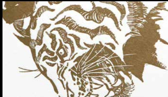
METALLIC (GOLD) ON WHITE